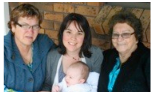
This Stroud story began in 1826

Friends were also on duty in the church on five days in July to welcome and address groups totalling more than 200. Northern Highlands Travel of Maitland organised the visits, which included lunch at the Stroud Monastery. The Friends' conservation funds benefited from the sale of cards and from a donation by the travel firm.