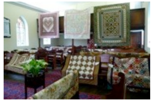
October Fair Quilt Display